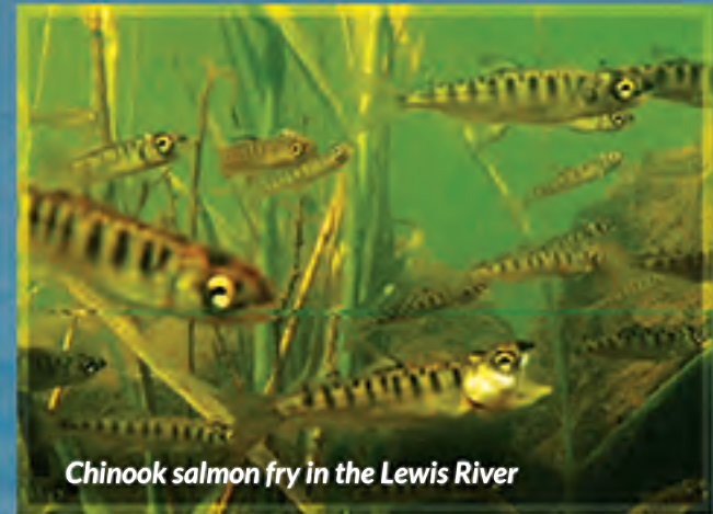
Chinook salmon fry in the Lewis River