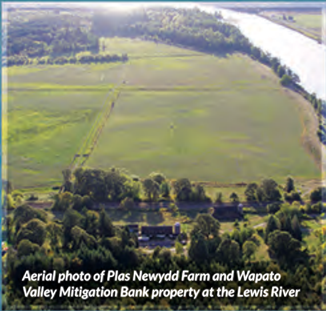
Aerial photo of Plas Newydd Farm and Wapato Valley Mitigation Bank property at the Lewis River